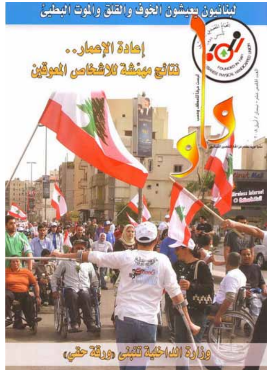
LPHU - Waw magazine

Fact-based lobbying led to a new electoral law in September 2008 that stipulated provisions to improve accessibility to polling stations, thus allowing persons with disabilities to exercise their right to vote on equal grounds with all Lebanese citizens (USAID 2008). Advocacy and lobbying from disabled persons' organizations and NGOs have contributed to the inclusion of the disability dimension in the National Education Five-Year Plan 2010–2015 (Ministry of Education and Higher Education 2010).